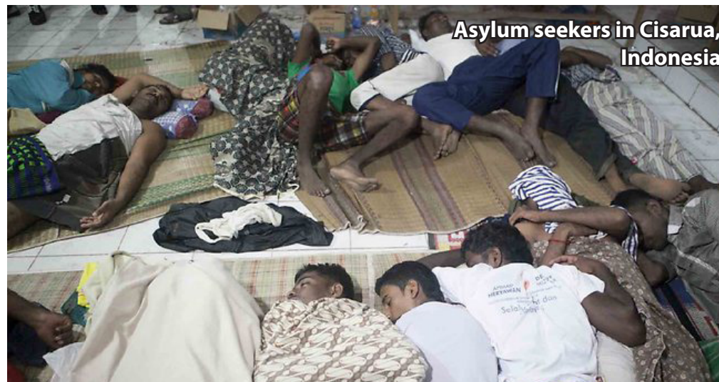
Asylum seekers in Cisarua, Indonesia

These people come from war zones or places where they are persecuted by their government. It is impossible for many to get travel documents, and may be dangerous to carry them anyway. Others may have to obtain false documents to get out of a dangerous country, or simply may not have had time to pack when they heard that their lives were in danger.